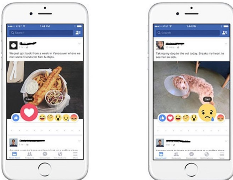
Figure 2 Facebook Reaction Buttons on the Website