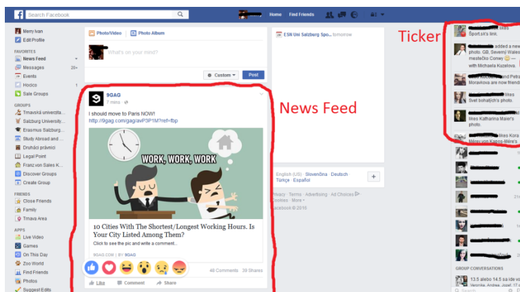
Figure 3 News Feed and Ticker