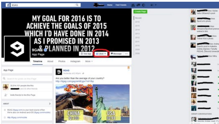
Figure 4 The “Like” Button as Following a Certain Facebook Website