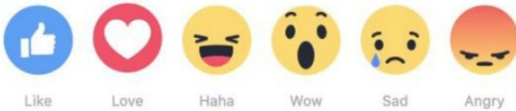
Figure 1 Facebook Reaction Buttons